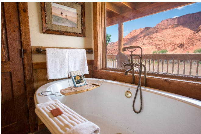
River View Balcony King