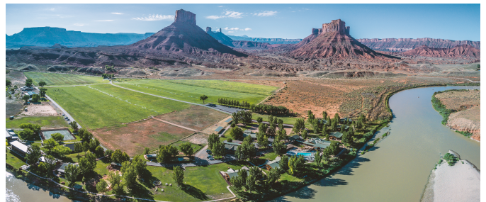
Arial View of the Ranch