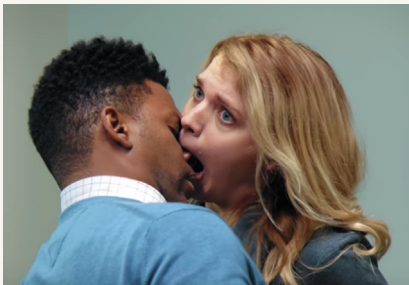
"Love at First Sight" ( Studio C )—Director