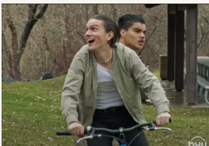
"Mobster Mess-Up" ( Studio C )—Writer