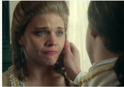
"Sketches of You" ( Studio C )—Director