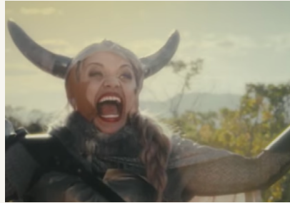
"Facebook Status" ( Studio C )—Writer