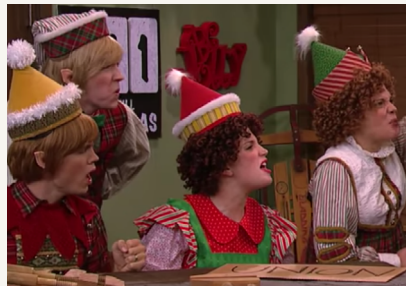
"Elf Union" ( Studio C )—Writer